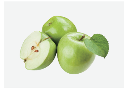
Green Apple Flavor

It has sweet and ripe pineapple aroma, used in drink, beverage and baking products