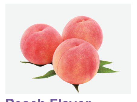
Peach Flavor Sweet and natural peach aroma, long-lasting, applied in dink, beverage and candy