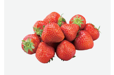
Strawberry Flavor It has ripe sweet

It has ripe sweet strawberry aroma, used in confectionery, beverage and dairy products