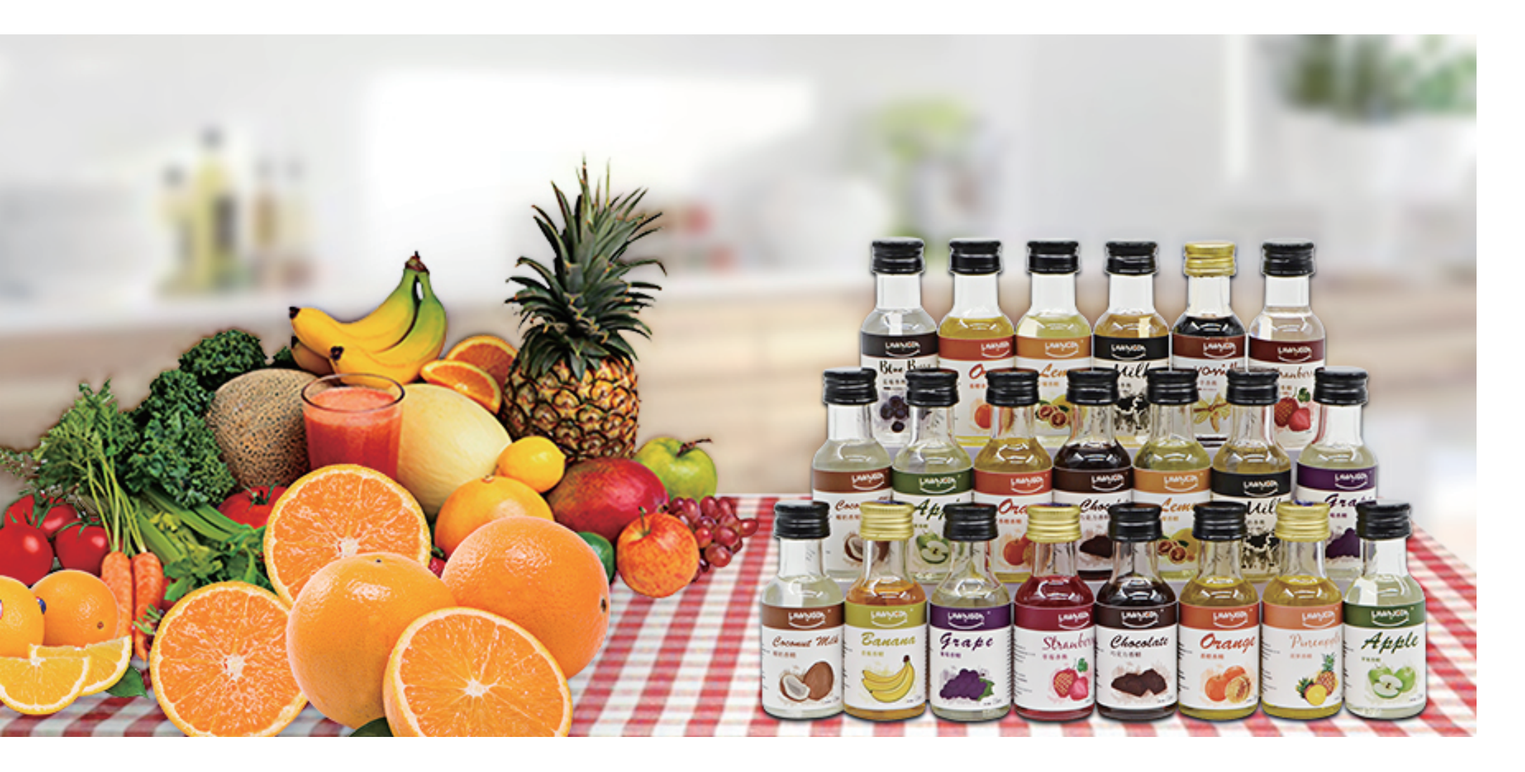
Zhengzhou United Asia Trading Co.,Ltd