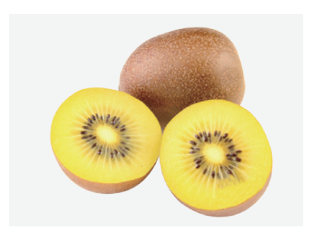
Kiwifruit Flavor It has sour and sweet ripe kiwi aroma, applied in drink, dessert, bakery