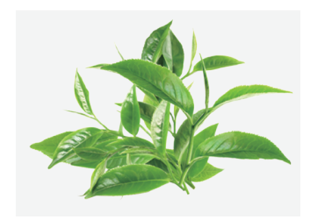
Green Tea Flavor

It has cool and fresh mint aroma, used in drink, beverage, confectionery and candy