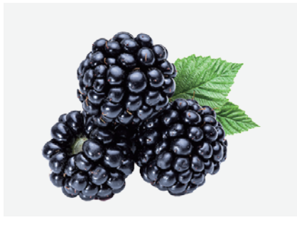
Blackberry Flavor Ripe blackberry aroma, good long lasting, applied to drink, beverage, bakery and confectionery