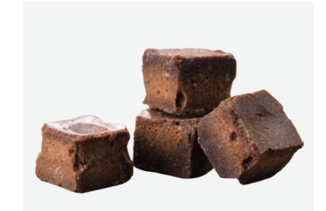
Brown Sugar Flavor

It has light fresh ginger spicy aroma, used in drink, beverage and confectionery