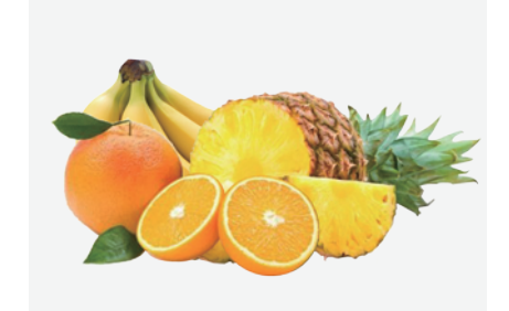
It is mixed many different fruit flavor, the body flavor can be banana, orange, lemon etc. we make it as buyer's requirement. Used in drink, beverage and candy