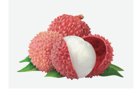
Lychee Flavor It has ripe sweet lychee aroma, used in drink, beverage and ice cream