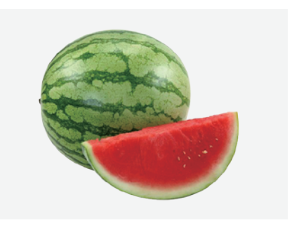
Watermelon Flavor It has fresh watermelon aroma, used in drink and beverage