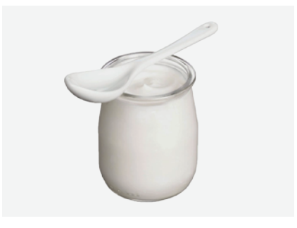
Thick Yogurt Flavor

It has natural cheddar flavors, applied in all kinds of food products