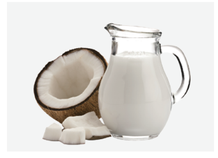
Coconut Milk Flavor

It has a rich and natural butter flavor, long-lasting, it is suitable for baking products