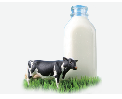
Fresh Milk Flavor

It has pure milk aroma, widely used in bakery, drink and beverage