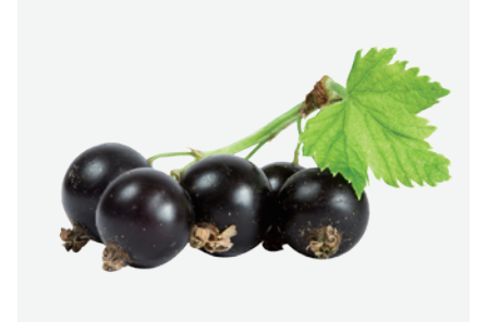
Black Currant Flavor It has natural black currant aroma, widely ued in confectionery, drink and beverage