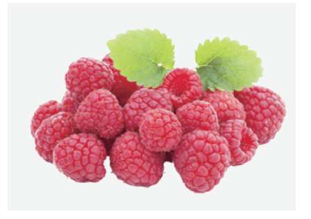
Raspberry Flavor It has ripe raspberry sweet aroma, used in juice, soft drink, ice cream etc