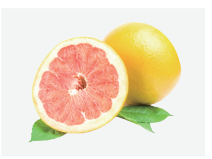
Grapefruit Flavor Ripe grapefruit aroma, slightly sweet and bitter, used in drink, bakery, ice cream