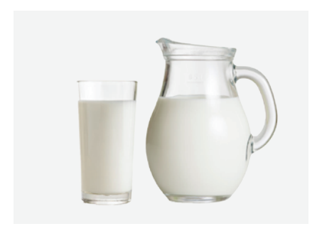
Pure Milk Flavor

With a sweet fragrant rich vanilla flavor, applied to all products